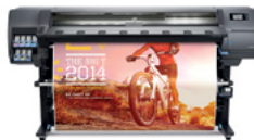
HP Latex 330 Printer Gain affordable access to indoor and outdoor signage