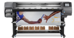
HP Latex 370 Printer More unattended printing at lower cost of operation