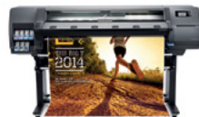
HP Latex 310 Printer Your entry option to outdoor— and a perfect fit for small spaces