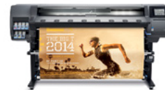
HP Latex 360 Printer Meet high quality standards at high speed